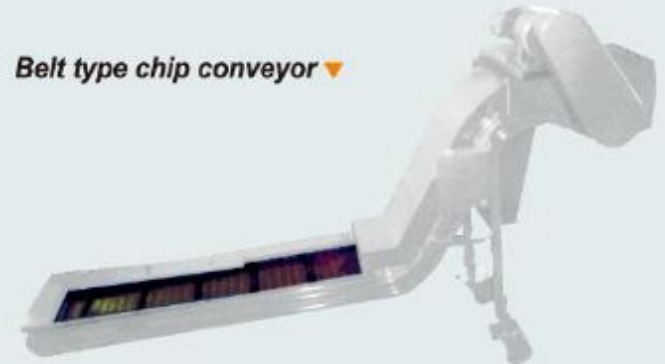
Belt type chip conveyor ▼