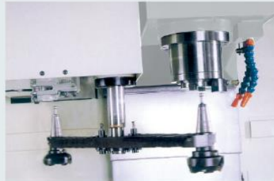
▲ Arm type tool changer