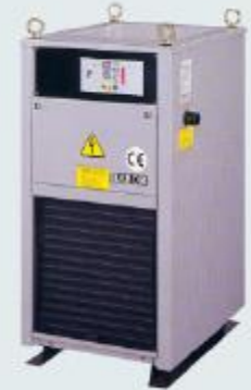
Spindle oil cooler ▶