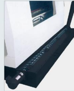
▲ Screw type chip conveyor