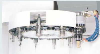
▲ Armless type tool changer